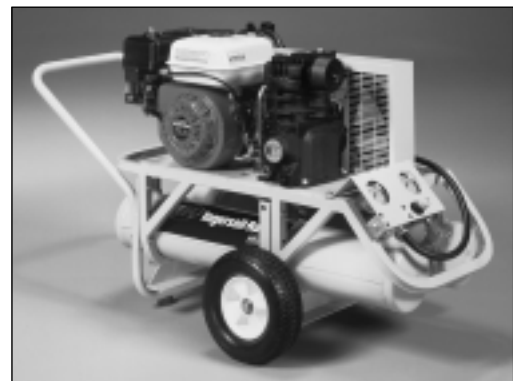
Base package plus cart assembly, regulation panel, and hose rack options.